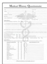
Semi-Structured: OCR ICR